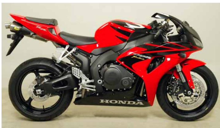
TITANIUM SILENCER KIT